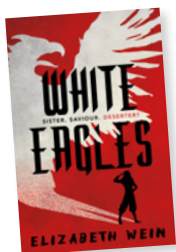
White Eagles by Elizabeth Wein BARRINGTON STOKES